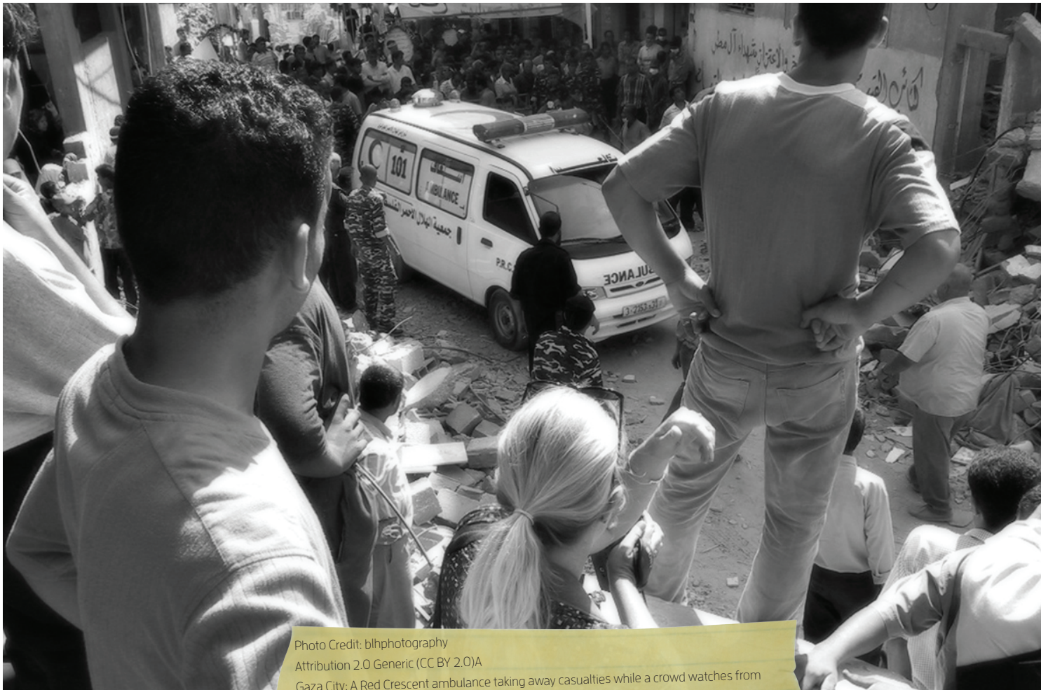
A Gaza City: A Red Crescent ambulance taking away casualties while a crowd watches from the rubble

The results showed that civilian casualty inequity information is very relevant in shaping U.S. public opinion towards Israel, especial for voters in the Independent political party. Interestingly, Republican and Democrat respondents were not notably influenced by their party's or their opposing party's criticism of Israel. This finding shows that even though most U.S. politicians are generally reluctant to voice an opinion regarding Israel, their criticism doesn't matter as much to public opinion as actual casualty inequity information reported in the media. The authors acknowledge that although this study advances what is known about influences to public opinion, their findings are based on a single experiment with a relatively small sample of U.S. voters. A larger survey of the public is needed to confirm their conclusions on how civilian casualty inequity may impact public opinion.