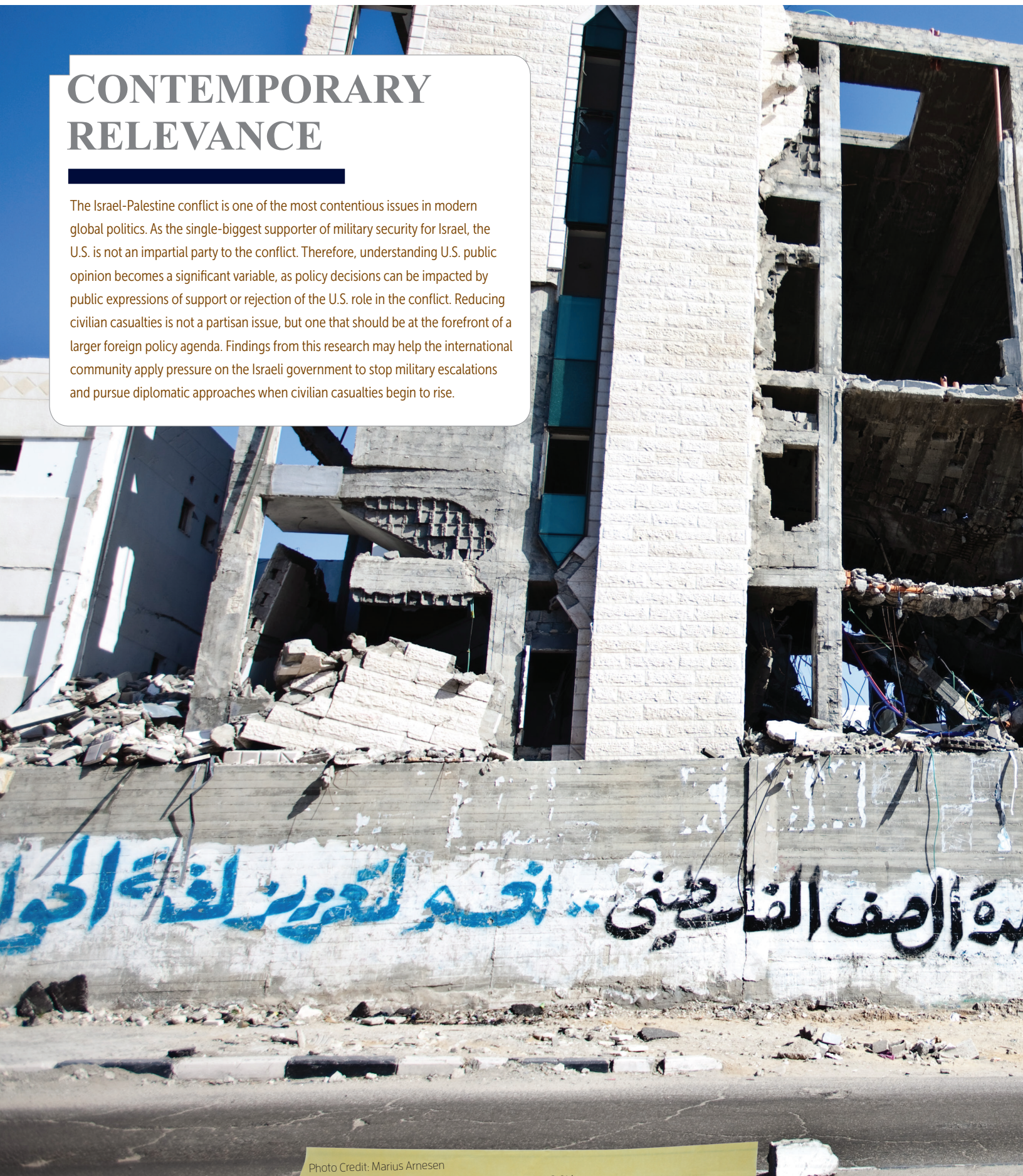
A Destroyed apartment building in Gaza

The Israel-Palestine conflict is one of the most contentious issues in modern global politics. As the single-biggest supporter of military security for Israel, the U.S. is not an impartial party to the conflict. Therefore, understanding U.S. public opinion becomes a significant variable, as policy decisions can be impacted by public expressions of support or rejection of the U.S. role in the conflict. Reducing civilian casualties is not a partisan issue, but one that should be at the forefront of a larger foreign policy agenda. Findings from this research may help the international community apply pressure on the Israeli government to stop military escalations and pursue diplomatic approaches when civilian casualties begin to rise.