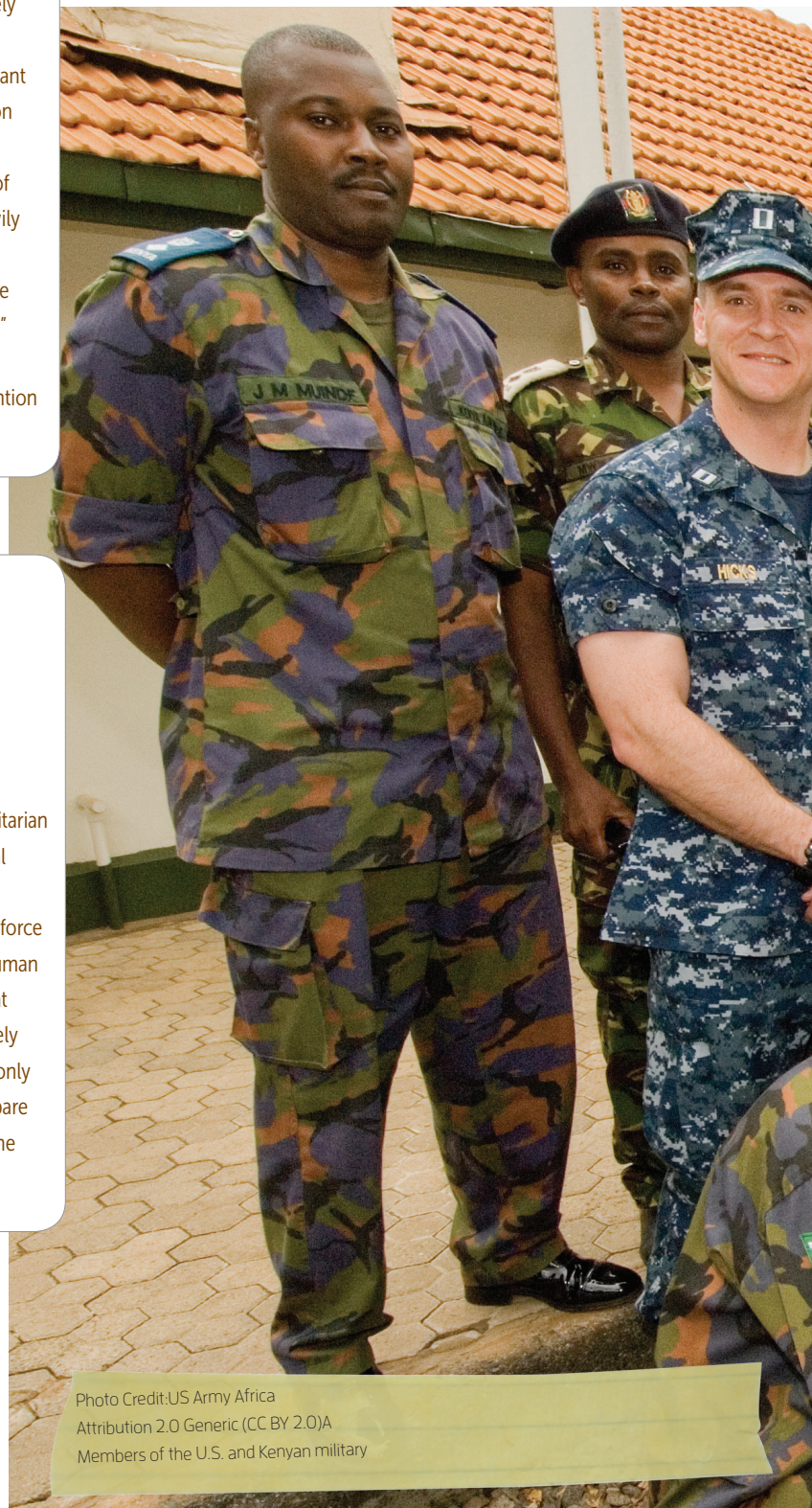
Photo Credit: US Army Africa Attribution 2.0 Generic (CC BY 2.0)A Members of the U.S. and Kenyan military

The United States preference to intervene militarily for humanitarian reasons provides an opportunity to evaluate what a constructive and effective humanitarian intervention looks like. The so-called Responsibility to Protect (R2P) is a global commitment to address the most severe crimes against humanity. While R2P primarily relies on non-military measures, it also allows for the use of military force to protect those facing atrocities. Since this research suggests the abuse of human rights as a prerequisite motive for military intervention, it is very important that the short and long-term impact and outcomes of these interventions be closely examined. Too often do the debates around responding to atrocities include only military intervention or complete inaction. Instead, practitioners should compare the human, social, political and economic costs of military interventions for the sake of protecting human rights to the many viable nonviolent alternatives.